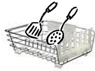
4. AIR DRY towel drying is prohibited