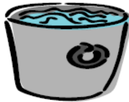
3. SANITIZE at least one minute in sanitizing solution